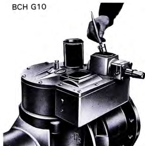
Grease for worms and gear wheel: BCH G10