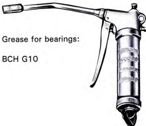
Grease for bearings: BCH G10