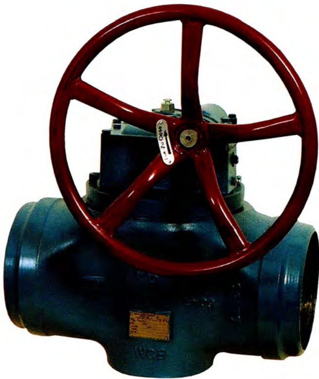
Gear Operated Valve with Vertical handwheel. Type C.