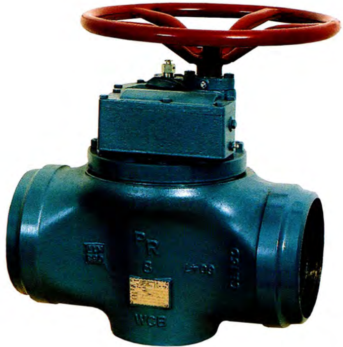
Gear Operated Valve with Horizontal handwheel. Type D.